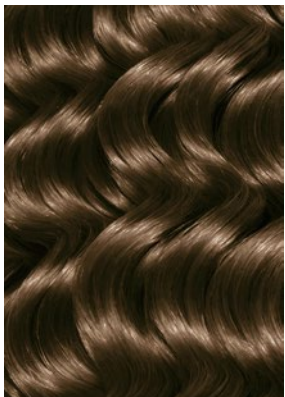
007021 6N COCOA CURLICUES