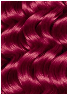
008802 5V GRAPE WAVES