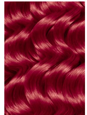
008801 6RG RED GOLDEN RINGS