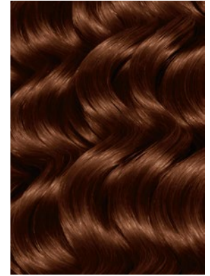
007022 6WB CINNAMON ROLL