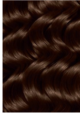
007027 5N CARAMEL CURLS