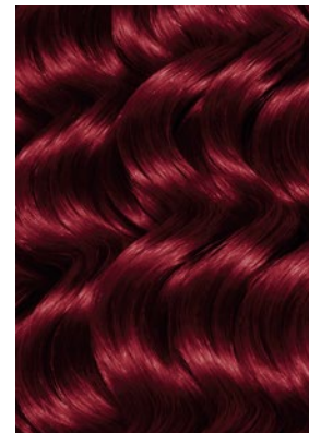
007033 5R RED-Y TO ROLL