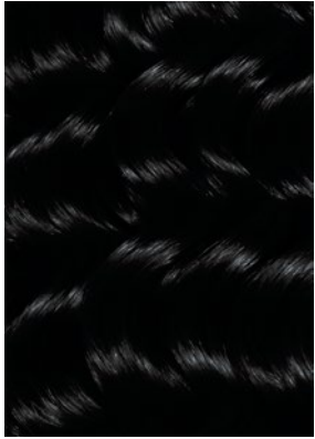
007026 1N CURLS' NIGHT OUT