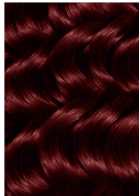
007031 4RM BERRY- GO-ROUND