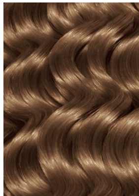
007023 7N TAUPE TWIST