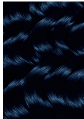
007020 3B WAVY NAVY