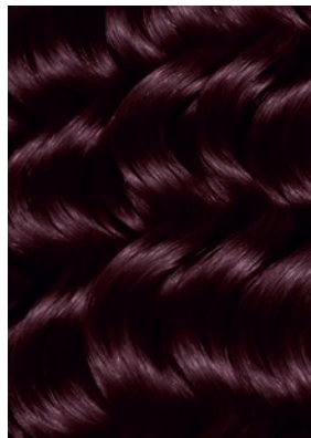
007029 3V TWISTED PLUM