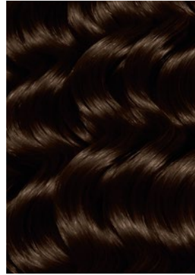
007030 4N CHESTNUT RINGLET