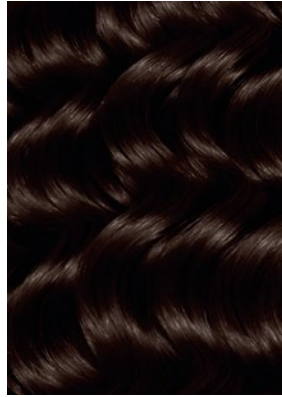
007028 3N LICORICE LOOPS