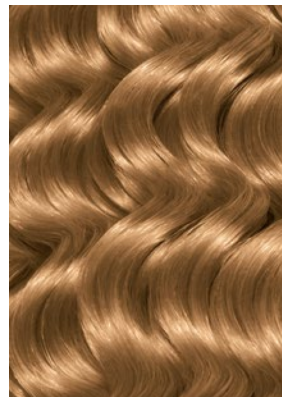
007034 8N GOLDEN SWIRL